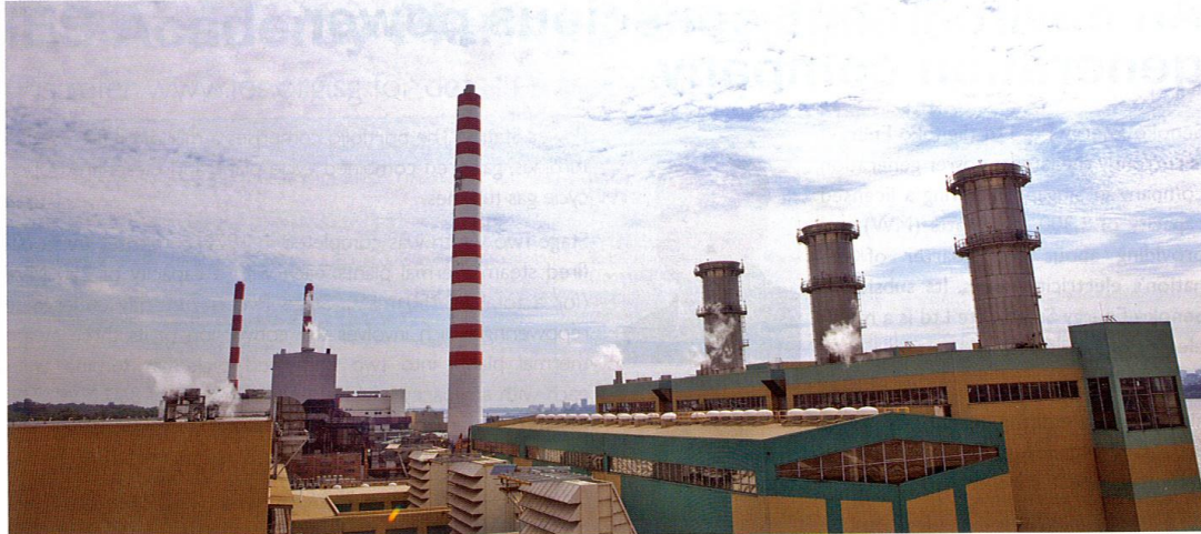
Chimney stacks of Stage 3 (middle) and CCP 3 - 5 (right). The repowering of CCP 3 - 5 involves the conversion of the old Stage 1 oil-fired steam units into combined cycle gas turbine units. The picture also shows that the Stage 2 chimney had already been dismantled as part of the Stage 2 repowering project which is now nearing completion.