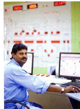
Operations staff working in front of a console in the control room where most of the operation of the plant takes place.

'Stage Two repowering actually gave a lot of impetus to the Singapore's electricity market', said Mr Kwong.