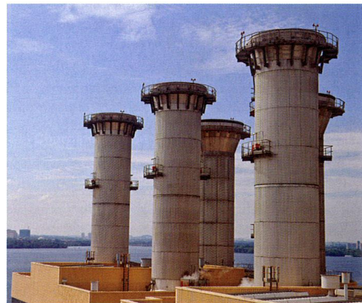
CCP 1 & 2 overlooking the Johor Straits with Johor Bahru at a distance. CCP 1 & 2 was Senoko Energy's and Singapore's first repowering project and involved the conversion of four open cycle gas turbines into two blocks of combined cycle gas turbines.

The combined cycle plants CCP 3 to 5 became fully operational in 2004, and involved the repowering of the former Stage One oil-fired steam thermal plant. Each of the three combined cycle plants, with Alstom turbines, has a capacity of 365 MW.